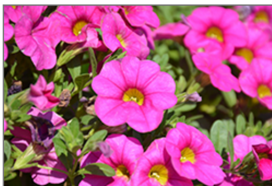
Unique Pink Calibrachoa flowers