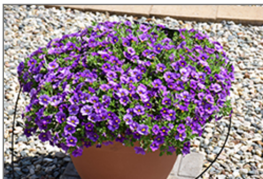
Unique Blue Violet Calibrachoa in bloom