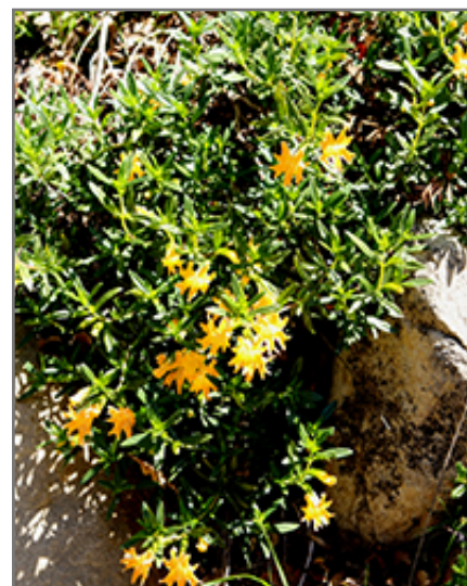
Large-flowered Bush Monkeyflower in bloom