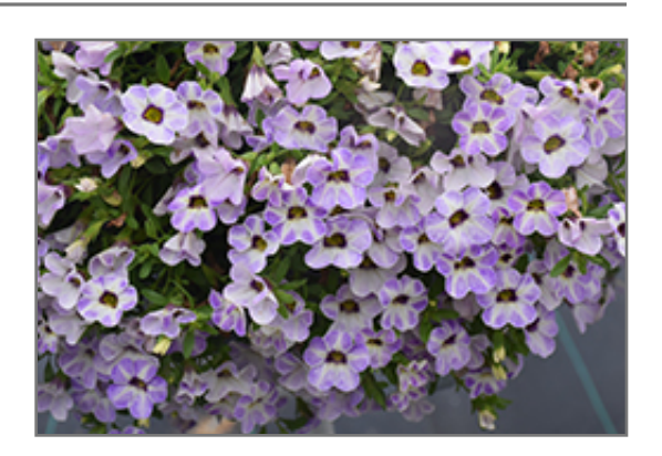
Chameleon Frozen Ice Calibrachoa flowers