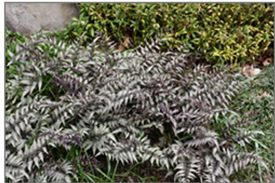
Pewter Lace Painted Fern