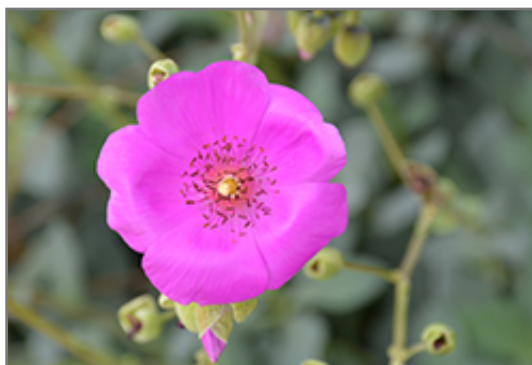
Jazz Time Rock Purslane flowers