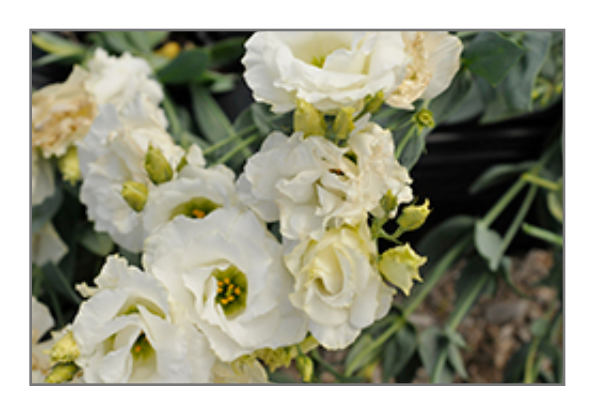
Echo Pure White Lisianthus flowers