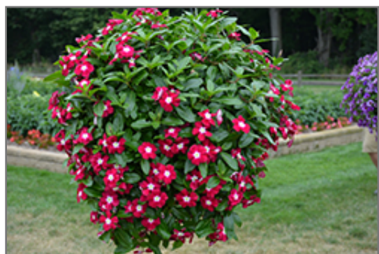
Mediterranean XP Burgundy Halo Vinca in bloom