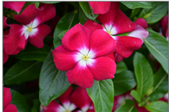
Mediterranean XP Burgundy Halo Vinca flowers

Mediterranean XP Burgundy Halo Vinca is recommended for the following landscape applications;