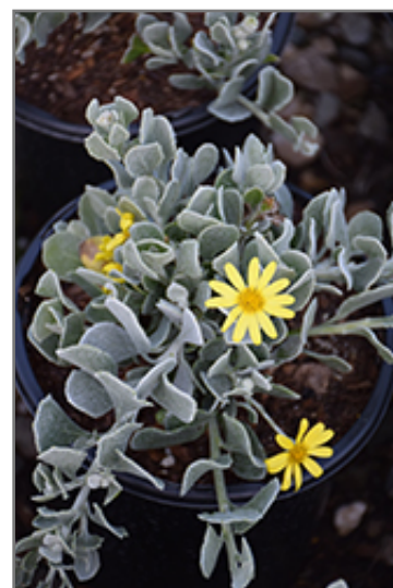
Vaalbietou flowers