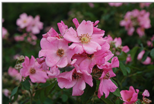
Polar Joy Rose flowers

Polar Joy Rose is recommended for the following landscape applications;