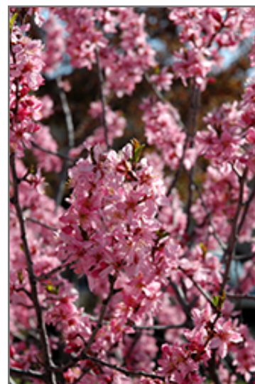
Muckle Plum (tree form) flowers