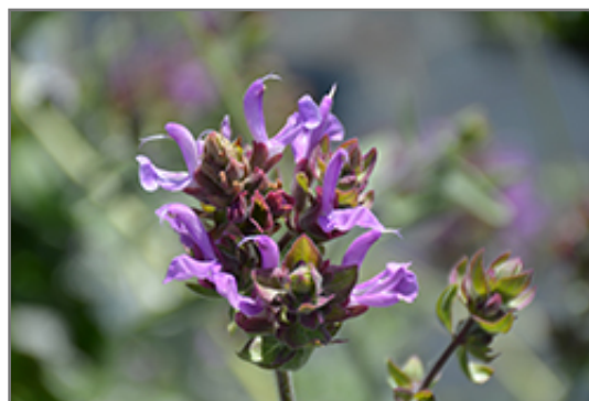
Lancelot Canary Island Sage flowers