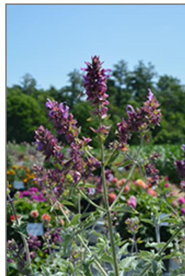
Lancelot Canary Island Sage flowers

This is a relatively low maintenance plant, and is best cleaned up in early spring before it resumes active growth for the season. It is a good choice for attracting bees, butterflies and hummingbirds to your yard, but is not particularly attractive to deer who tend to leave it alone in favor of tastier treats. It has no significant negative characteristics.