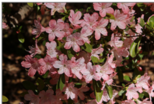
Shin Utena Azalea flowers