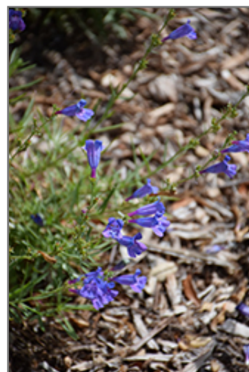
Margarita BOP Beard Tongue flowers