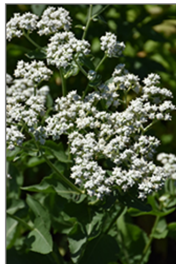
Wild Quinine flowers

Wild Quinine is recommended for the following landscape applications;