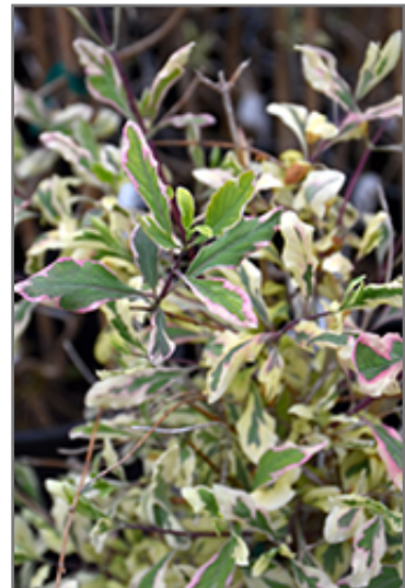
Harlequin Honeysuckle foliage