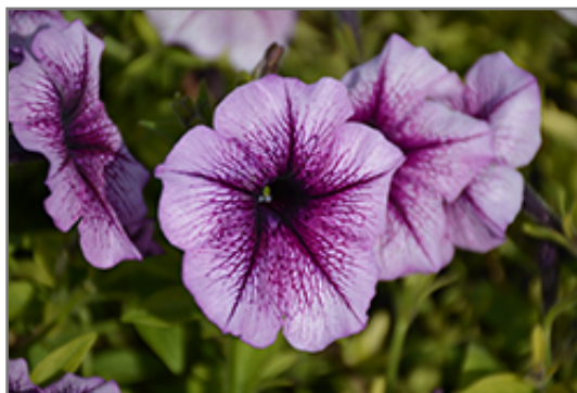
Opera Supreme Purple Vein Petunia flowers

Opera Supreme Purple Vein Petunia is recommended for the following landscape applications;