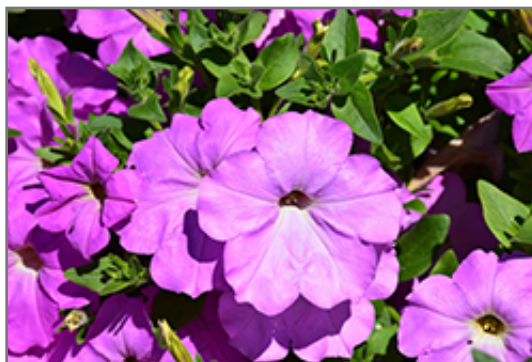
Opera Supreme Lavender Petunia flowers