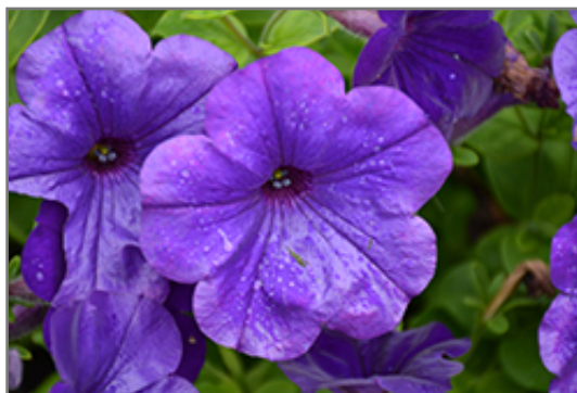
Opera Supreme Blue Petunia flowers

Opera Supreme Blue Petunia is recommended for the following landscape applications;