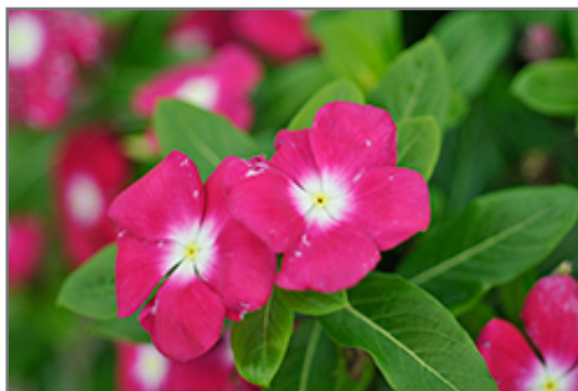
Pacifica XP Magenta Halo Vinca flowers

Pacifica XP Magenta Halo Vinca is recommended for the following landscape applications;