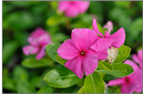
Pacifica XP Lilac Vinca flowers

Pacifica XP Lilac Vinca is recommended for the following landscape applications;