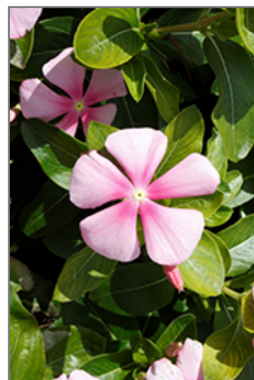
Pacifica XP Icy Pink Vinca flowers

Pacifica XP Icy Pink Vinca is recommended for the following landscape applications;