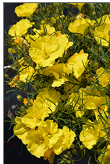
Ladybird Sunglow Texas Primrose flowers

Ladybird Sunglow Texas Primrose is recommended for the following landscape applications;