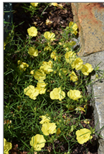
Ladybird Sunglow Texas Primrose in bloom

Ladybird Sunglow Texas Primrose is a fine choice for the garden, but it is also a good selection for planting in outdoor pots and containers. It is often used as a 'filler' in the 'spiller-thriller-filler' container combination, providing a mass of flowers against which the thriller plants stand out. Note that when growing plants in outdoor containers and baskets, they may require more frequent waterings than they would in the yard or garden.