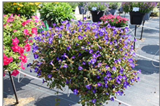
Summer Wave Bouquet Deep Blue Torenia in bloom