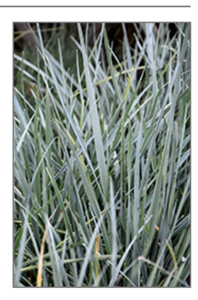
Blue Wheatgrass foliage

A cool season grass that features stunning metallic blue foliage and a clumping, upright arching habit; light blue flowers appear above the foliage in spring; struggles in hot, dry conditions or winter wet; an excellent edging plant