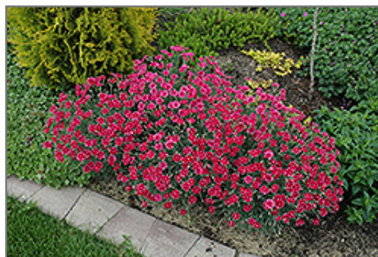
Bridgette Pinks in bloom