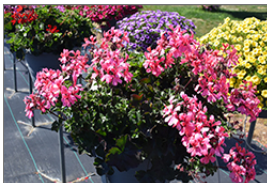
Caldera Salmon Geranium in bloom