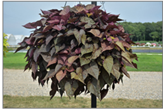
Floramia Rosso Sweet Potato Vine