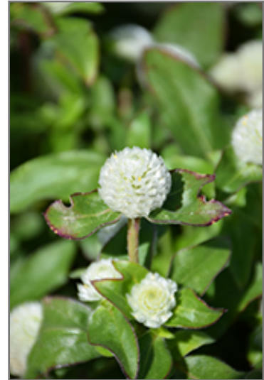
Gnome White Gomphrena flowers

Gnome White Gomphrena is recommended for the following landscape applications;