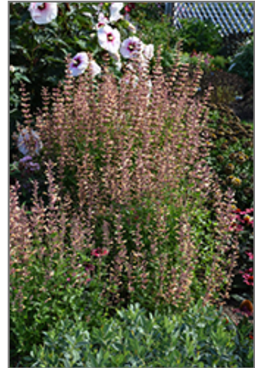
Meant To Bee Queen Nectarine Anise Hyssop in bloom

Meant To Bee Queen Nectarine Anise Hyssop is a fine choice for the garden, but it is also a good selection for planting in outdoor pots and containers. With its upright habit of growth, it is best suited for use as a 'thriller' in the 'spiller-thriller-filler' container combination; plant it near the center of the pot, surrounded by smaller plants and those that spill over the edges. It is even sizeable enough that it can be grown alone in a suitable container. Note that when growing plants in outdoor containers and baskets, they may require more frequent waterings than they would in the yard or garden.