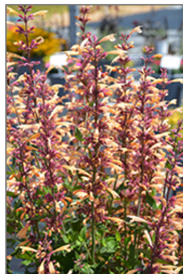
Meant To Bee Queen Nectarine Anise Hyssop flowers

Meant To Bee Queen Nectarine Anise Hyssop is recommended for the following landscape applications;