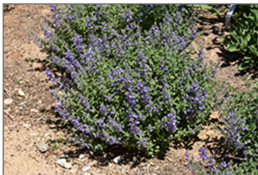
Sylvester Blue Catmint in bloom