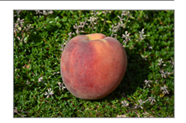
August Pride Peach fruit

This is a deciduous tree with a more or less rounded form. Its average texture blends into the landscape, but can be balanced by one or two finer or coarser trees or shrubs for an effective composition. This plant will require occasional maintenance and upkeep, and is best pruned in late winter once the threat of extreme cold has passed. Gardeners should be aware of the following characteristic(s) that may warrant special consideration;