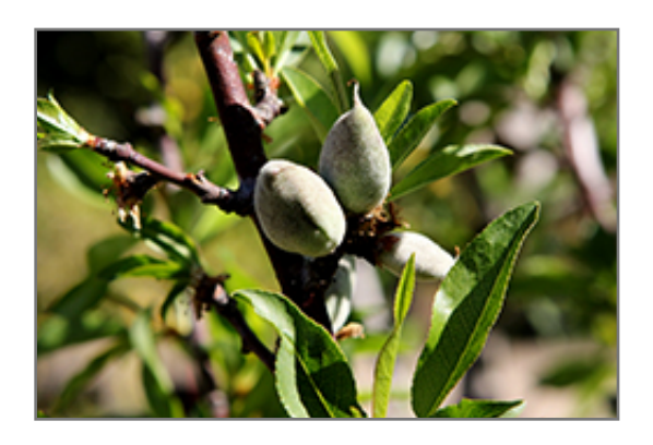
All-In-One Almond fruit