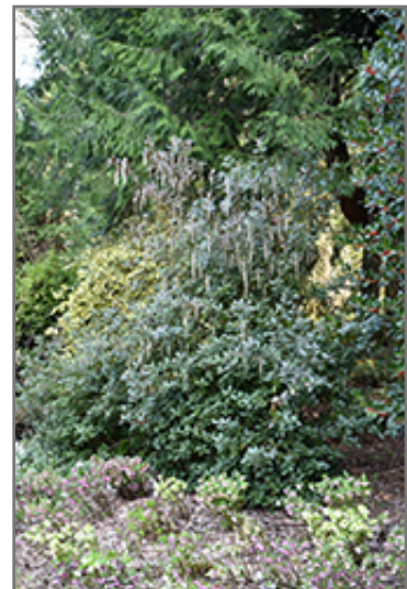
Siskiyou Jade Silk Tassel Bush in bloom