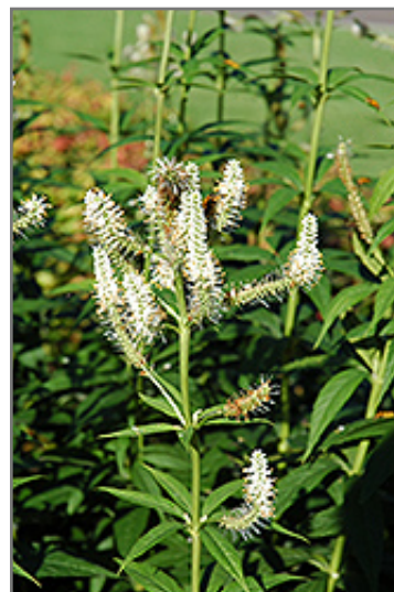
Culver's Root flowers