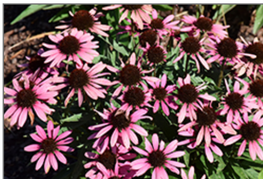
Dark Shadows Wicked Coneflower flowers

Dark Shadows Wicked Coneflower is recommended for the following landscape applications;