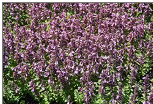
Pride Of Georgia Germander in bloom