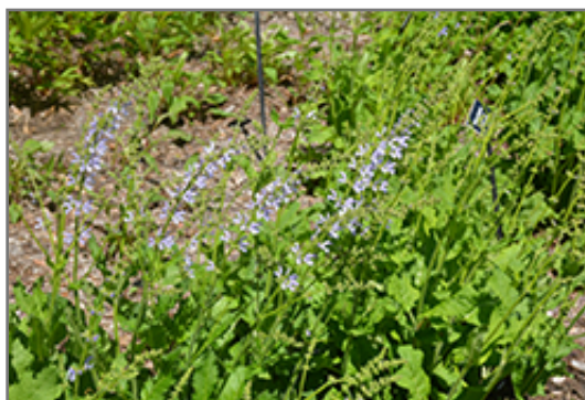
Ballet Sky Dance Sage in bloom