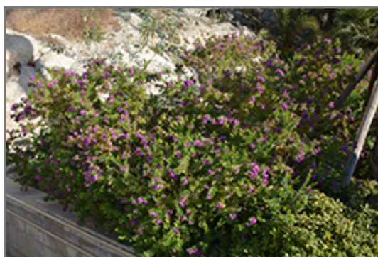
Grandiflora Sweet Pea Shrub in bloom