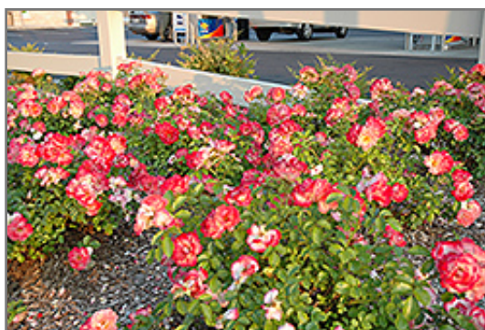
Flower Carpet Sunset Rose in bloom