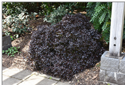
Tom Thumb Kohuhu