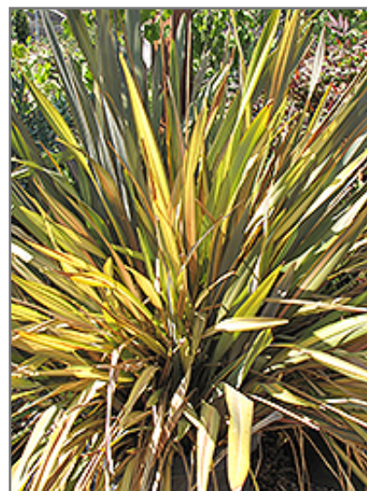
Terracotta New Zealand Flax