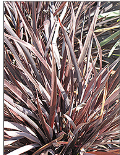
Electric Black Light New Zealand Flax