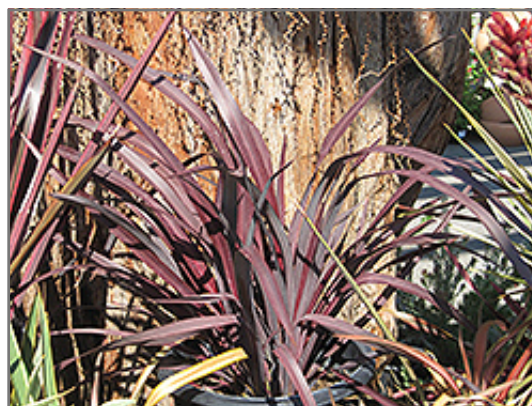
Dark Delight New Zealand Flax