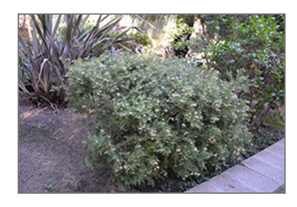
Mt. Tamboritha Woolly Grevillea in bloom

Mt. Tamboritha Woolly Grevillea will grow to be about 20 inches tall at maturity, with a spread of 5 feet. It tends to fill out right to the ground and therefore doesn't necessarily require facer plants in front. It grows at a slow rate, and under ideal conditions can be expected to live for approximately 20 years.