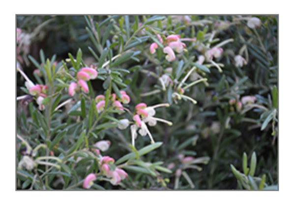
Mt. Tamboritha Woolly Grevillea flowers