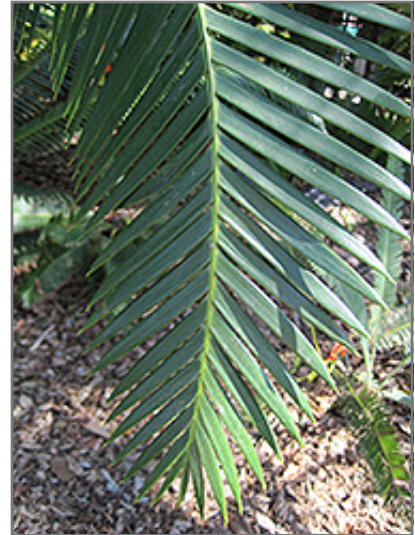
Mejia's Dioon foliage

This plant is not reliably hardy in our region, and certain restrictions may apply; contact the store for more information.