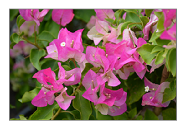
Imperial Thai Delight Bougainvillea flowers