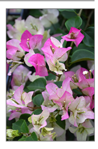
Imperial Thai Delight Bougainvillea flowers