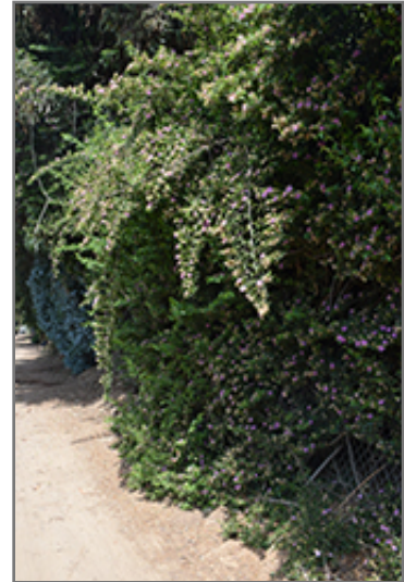
Crossberry in bloom

This plant is not reliably hardy in our region, and certain restrictions may apply; contact the store for more information.