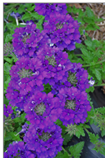
Samira Deep Blue Verbena flowers

Samira Deep Blue Verbena is recommended for the following landscape applications;