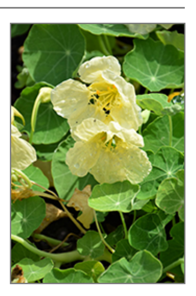
Milkmaid Nasturtium flowers